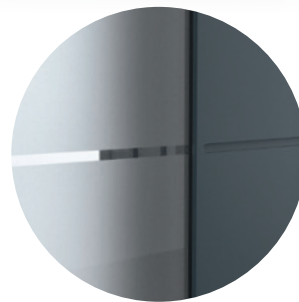
Sandblasted surface area with clear stripes