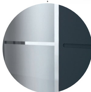
Sandblasted surface area with clear stripes and clear glass edges